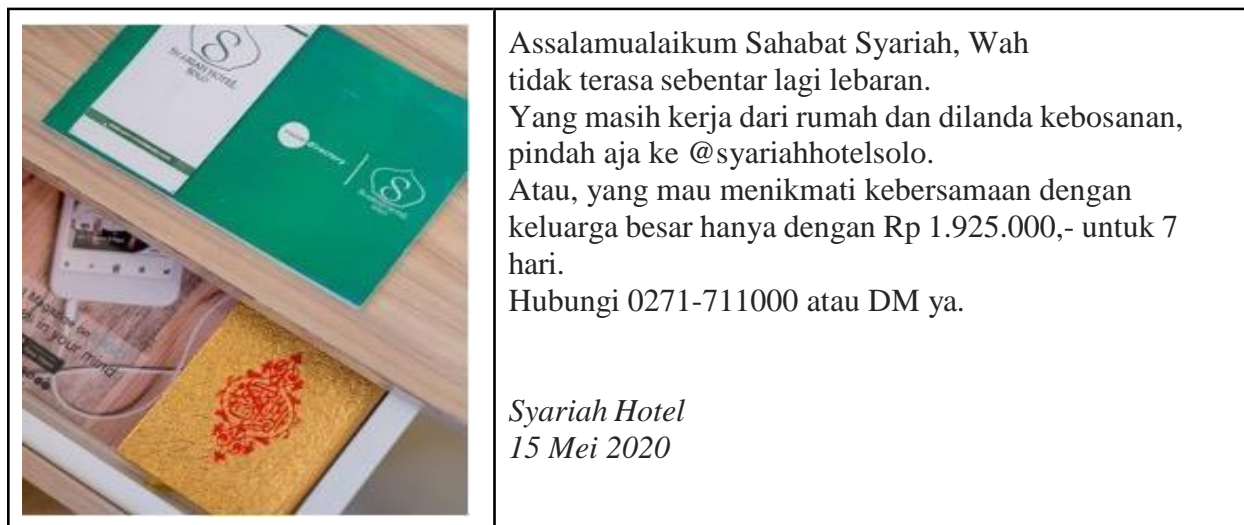
Example 1: Uploaded by Syariah Hotel

In this section, Syariah Hotel Solo employs strategy to promote their product. In their account, we see how Syariah Hotel promotes their product using Islamic symbols in the visual and using Islamic terms in the copywriting.